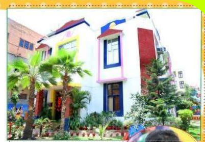
Charming High-impact, through which we ensure the maximum growth in a child.

The team of ICN is helping to develop the psychomotor skills through 'learning by doing' process. The emphasis is on the physical, mental and emotional growth of the child to make them self-reliant. The teachers help the kids to make an interest in the unique building mode which makes them eager to pursue excellence in all spheres.